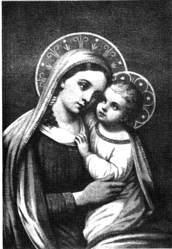
Holy Mary, Mother of God, pray for us!