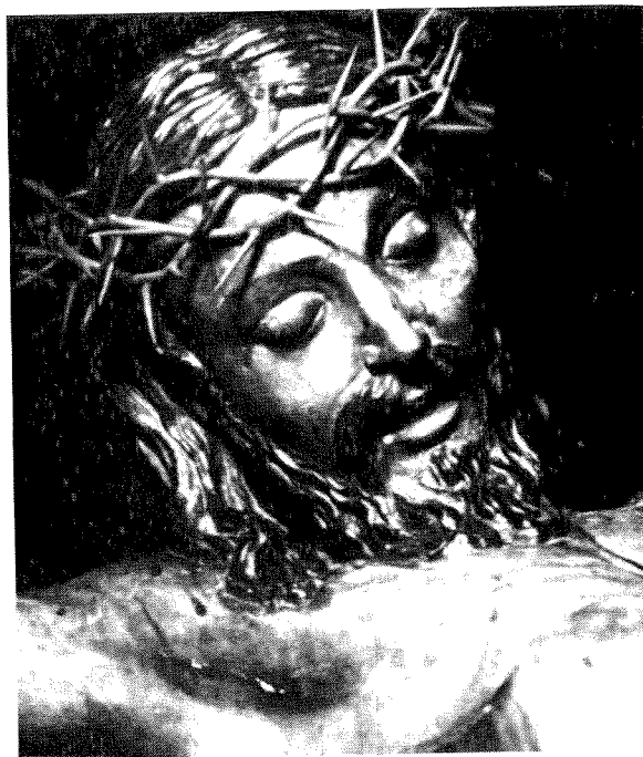
Our Lord crowned with thorns

“They placed upon His sacred head a cap made of plaited thorns to serve Him as a crown. This cap was woven of thorn branches and in such a manner that many of the hard and sharp thorns would penetrate into the skull, some of them to the ears and others to the eyes. Hence one of the greatest tortures suffered by the Lord was that of the crown of thorns . . .”